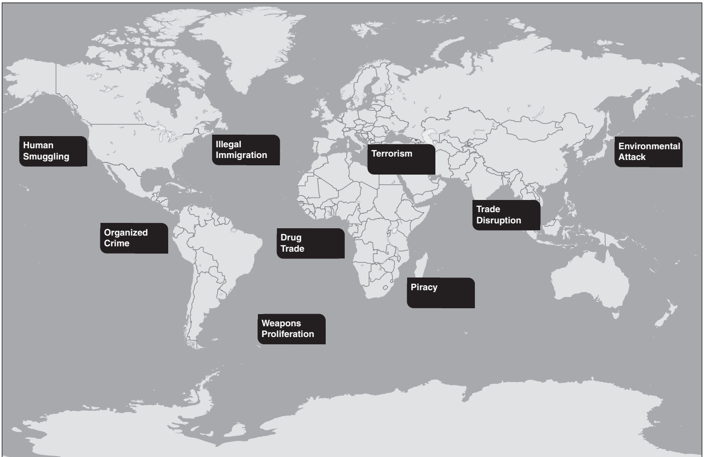
Figure 1: Maritime Challenges