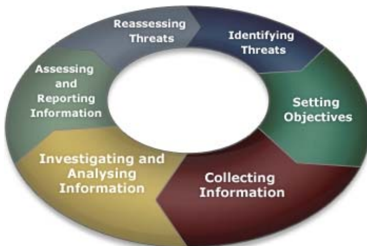
The Security Intelligence Lifecycle