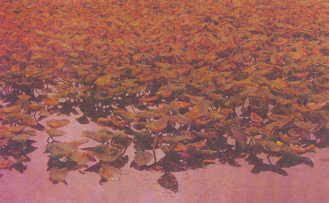
cocoon gesticulating in jars