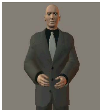
Figure 1 Example of signing avatar

Typically, airport information announcements, such as gate changes and delays, are announced over a PA system and often such information does not appear on screens for some time if at all. This causes considerable hindrance to D/deaf and HOH people who may be left uninformed and possibly inconvenienced through no fault of their own. To help alleviate this, we chose to orient our MT system specifically toward this domain. In an airport scenario, should there be alterations to flight information, the relevant piece of information could be typed into the MT system, which would automatically translate the sentence into ISL. The information would then be signed in real ISL by a mannequin on video screens for people to view. An example of the generated mannequin that would sign the output is in Figure 1 taken from Poser 4 ProPack Software 4 .