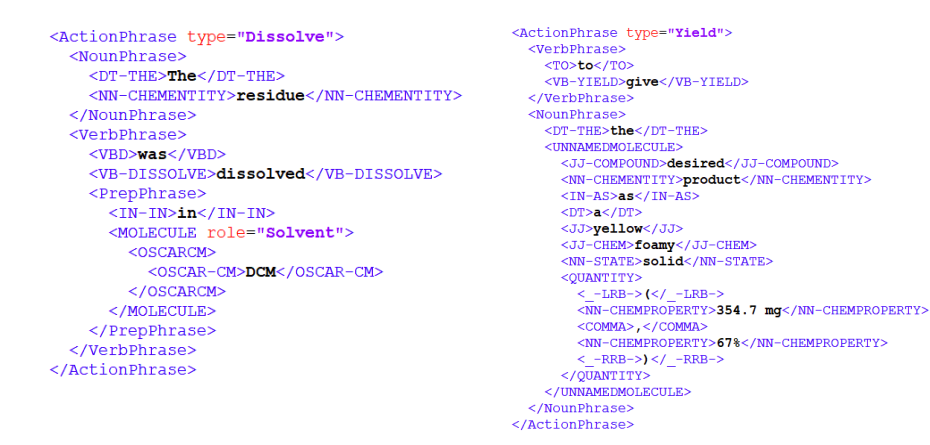
Fig. 2. Example of ChemicalTagger parse trees with action phrases

In the Patent Reaction Extraction project [5] this parse tree, in combination with chemical structure information (from chemical name to structure), and heuristics is used to assign the role of each compound. These roles are: product, reactant, solvent and catalyst. If the parse tree indicates that a chemical is involved in a workup action the chemical is ignored. The system assigns compounds as reactants if no clear indication is given to the contrary. Anaphora resolution is also used to resolve references to chemical structures defined in preceding experimental sections. Finally atom mapping is used to sanity check the results and typically reactions for which an atom mapping cannot be established are rejected. A solvent may be reclassified as a reactant to obtain a successful atom mapping. The atom mapping is used to determine the stoichiometry of the chemicals in the reaction.