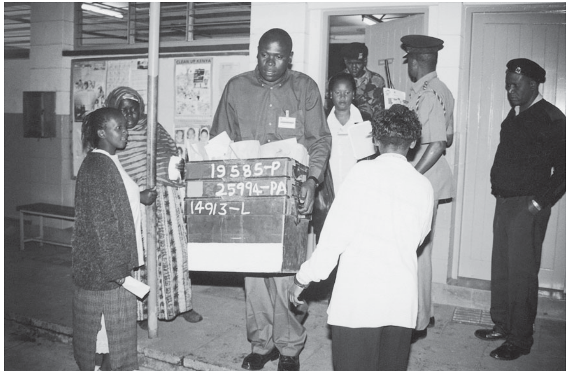
A presiding officer collects his polling station materials in the early morning before the opening of polls on Dec. 27.

The Carter Center consulted with other international observer groups, including the EU and the Commonwealth, to coordinate deployment within and across provinces. This allowed the various missions to maximize their collective coverage of polling stations and ensure that relevant information was shared