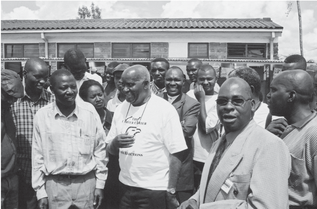
President Kaunda speaks with voters outside a polling station.

In a limited number of instances, observers felt that the police appeared to do little to control people at crowded polling stations. Of a more serious nature were reports of vote buying at several polling stations, but these incidents could not be adequately investigated.