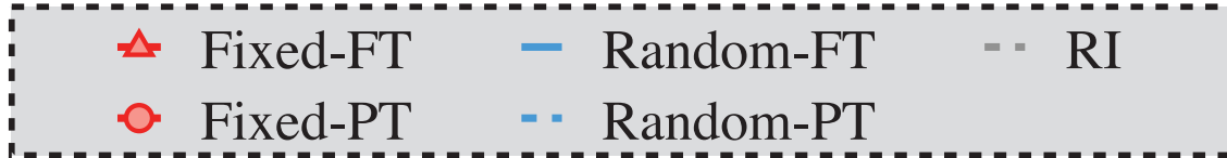
Effect of mask sizes on UCF101