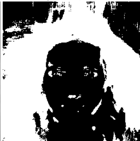
Binary Map (0.1)