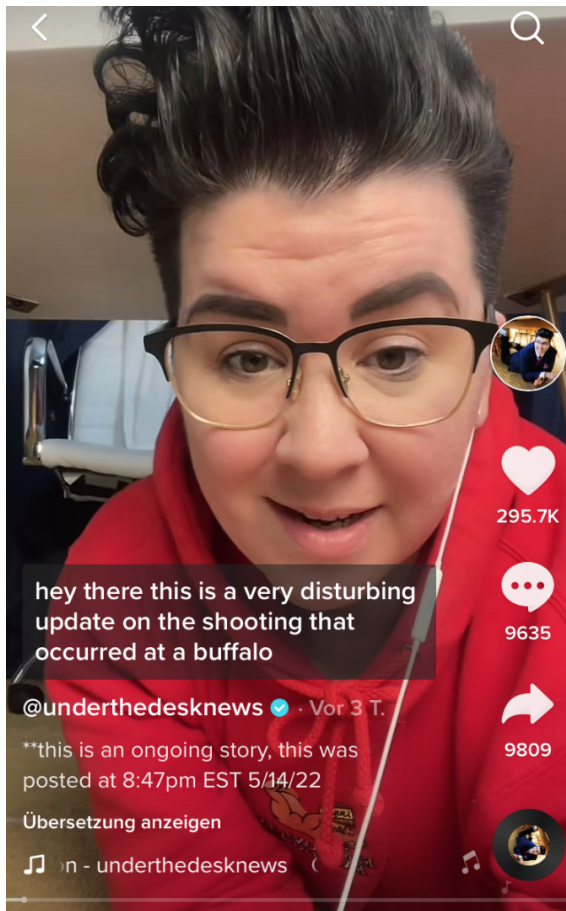
Figure 2: Example from @underthedesknews on TikTok providing calm, quietly-spoken news from underneath a desk, about a recent shooting in Buffalo.

entangled; (2) Gen Zers’ information journeys often do not begin with a truth-seeking search query; and (3) Gen Zers use information to orient themselves socially and define their emerging identities. We handle RQ3 (susceptibility to misinformation) in 5.2.