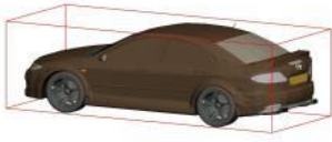
(a) 3D CAD Model of Car