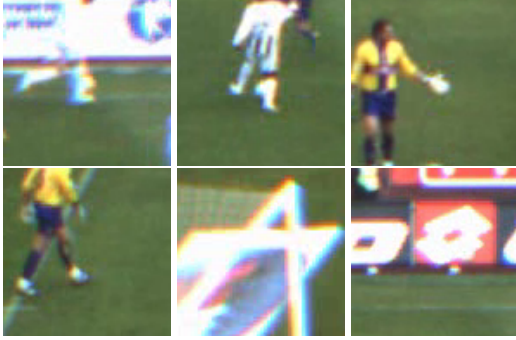
Figure 5: Visualization of incorrect ball detection results. Top row show image patches where the ball is not detected (false negatives). The bottom row shows patches with incorrectly detected ball (false positives).

Faster R-CNN throughput on the same video is only 8 FPS (Faster-RCNN implementation based on ResNet-50 backbone, included in PyTorch 1.2 distribution https://pytorch.org ). DeepBall network has the highest performance (87 FPS) but it's a tiny network built for ball detection only.