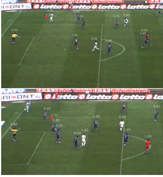
Figure 2: Player and ball detection results. Numbers above bounding boxes show detection confidence from the player classifier.