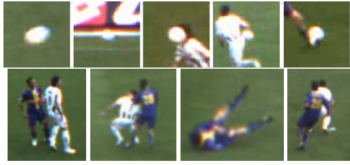
Figure 1: Exemplary patches illustrating difficulty of the ball and players detection task. Images of the ball exhibit high variance due to motion blur or can be occluded by a player. Players can be in a close contact and occluded.

can efficiently process high definition video input in a real time. It achieves 37 frames per second throughput for high resolution (1920x1080) videos using low-end GeForce GTX 1060 GPU. In contrast, Faster-RCNN (?) generic object detector runs with only 8 FPS on the same machine.