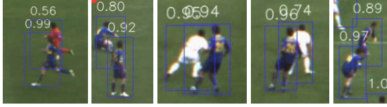
Figure 3: Detection results in difficult situations (player occlusion).

red circle. Fig. ?? show player detection performance in difficult situations, when players' are touching each other or occluded.