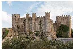
Castle of Óbidos