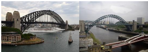
Sydney Harbour Bridge