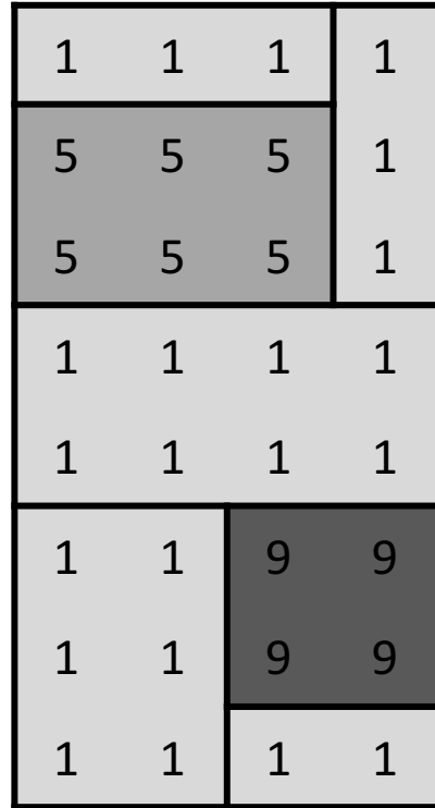
(c) Step 3: Group tiles w/ similar scores