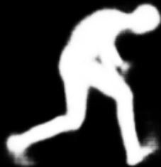
synthesis w/o GAN