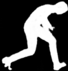
synthesis w/ GAN