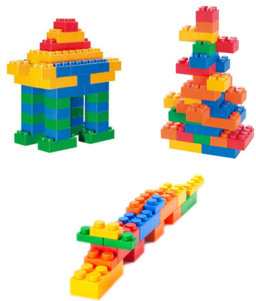
classical ML solutions