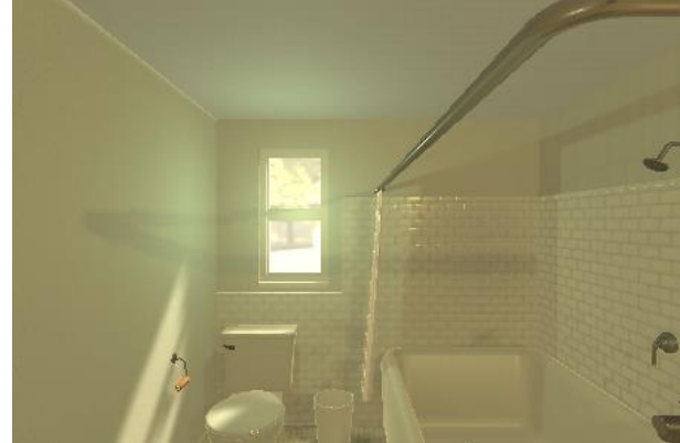
t = -5 , forward