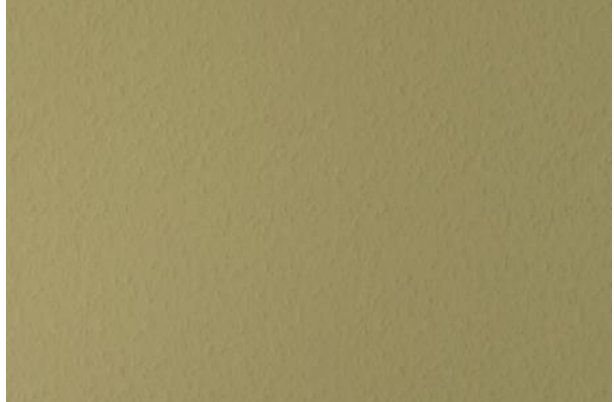
t = -8 , rotate right