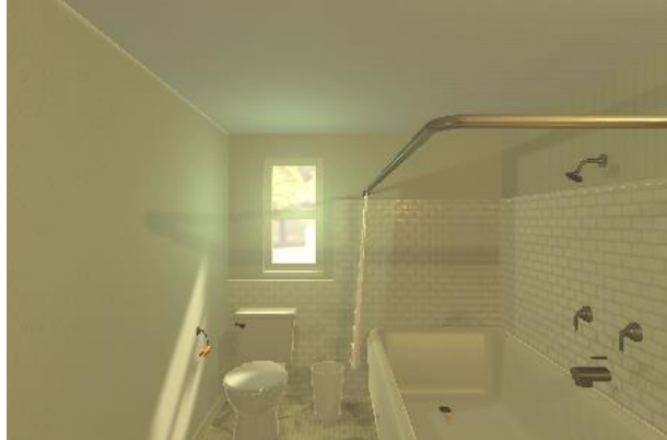
t = -7 , forward