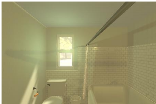
t = -4 , rotate right