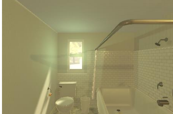
t = -6 , forward