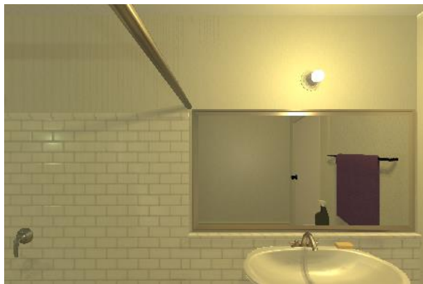
t = -3 , rotate right