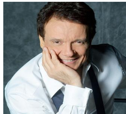
Single-label images from ImageNet