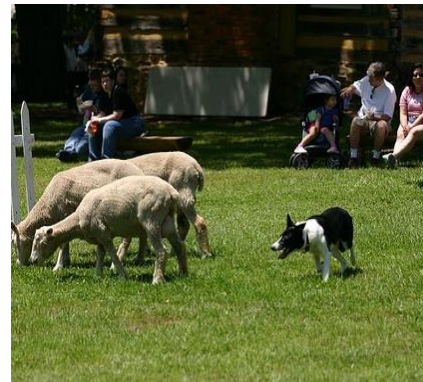
Multi-label images from Pascal VOC