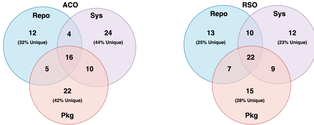
Fig. 7. Diversity of Applicable Comments Generated by ACO and RSO Based Strategies in Terms of Comment Category