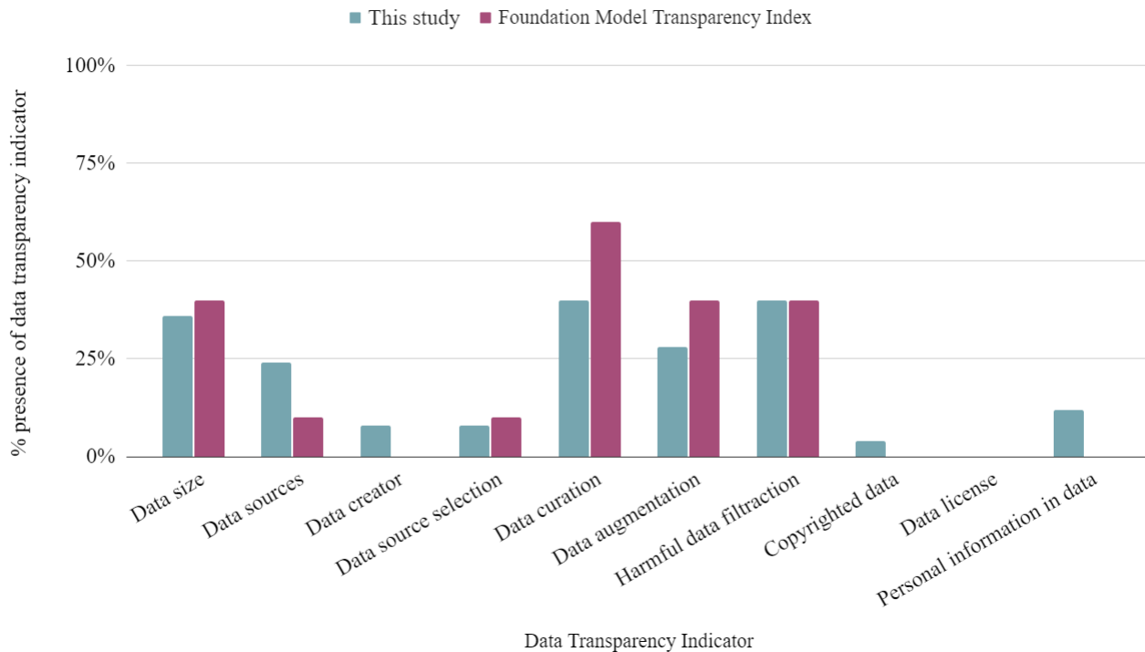
Figure 3: AI models scoring a point for each data indicator in this research (n=25) in comparison to the findings of the Foundation Model Transparency Index (n=10) ((Bommasani et al. 2023b))

leased within the relevant time period for the incident. For those where we could not identify a clear input-output mechanism/model underlying the system/function (we included those where this was not explicitly called a 'model'), we considered that we were not able to apply the search protocol outlined. We discuss the challenges in identifying model transparency information in sections 4.1 and 5.1.