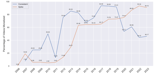
Figure 2: Percentage of videos with monetisation cues by channel category over time.

A significant decline in the monetisation cues of Consistent channels around the same time further accentuated this trend. This drop could be linked to several high-profile creators within this group becoming less active on YouTube, possibly due to moving to other platforms or the impact of controversies leading to them being “cancelled” [19] and consequently reducing their activity. A notable