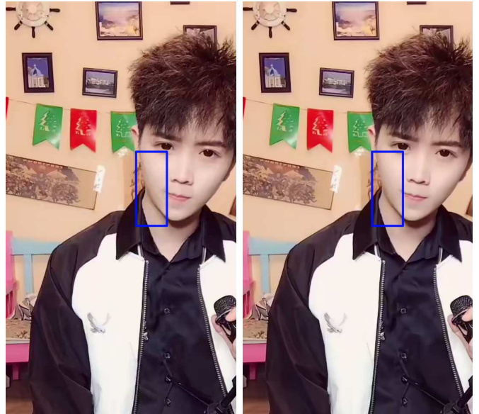
(a) HM Rec. 0.243bpp PSNR 37.90. (b) Enhanced. 0.231bpp PSNR 38.31.

We use the 8 PCS grand challenge short videos to test, and the test condition includes four QPs (22 27 32 37) and two configurations (AI and RA). The test results are shown in TABLE I. In the AI configuration, for the luminance component, we get BD-rate saving of at most 12.83% and on average 10.24%. BD-rate saving of 12.41% and 14.24%