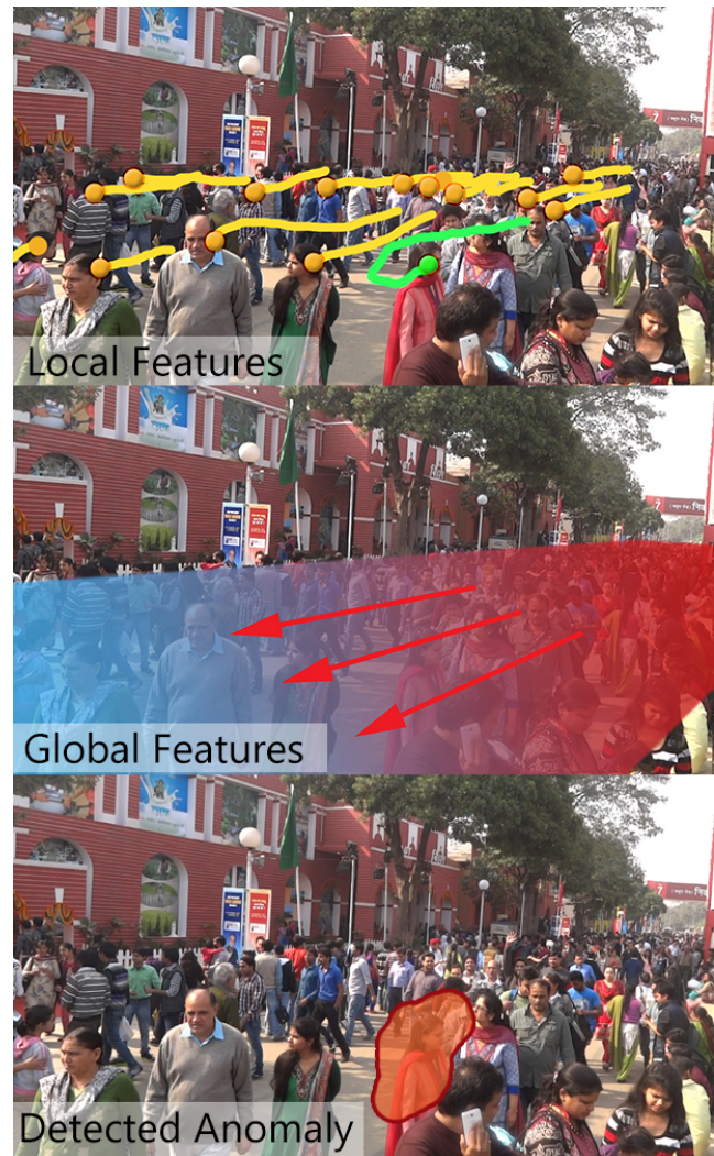
Figure 2: The Anomaly Detection In this example, we see that one pedestrian (marked with green) suddenly makes a U-turn (local feature) in a crowd where everyone is walking in a specific direction/field (global feature). Our system detects this as an anomaly.

edge or future state information for any agent. Because we estimate the state during each frame, our formulation can capture the local and global behavior or the intent of each agent.