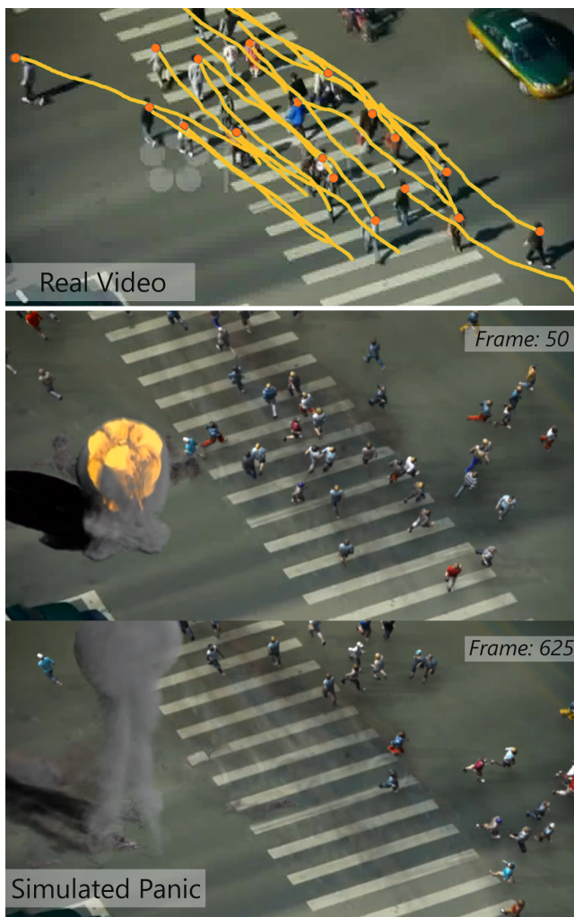
Figure 1: Our method extracts trajectories and computes pedestrian movement features at interactive rates. We use the learned behavior and movement features to detect anomalies in the pedestrian trajectories. The lines indicate behavior features (explained in detail in Section 3.5). The yellow lines indicate anomalies detected by our approach.