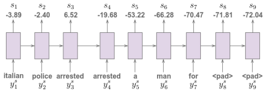
Figure 3: When the second arrested appears, as the sentence becomes ungrammatical, the discriminator determines that this example comes from the generator. Hence, after this time-step, it outputs low scores.

As shown in Fig. 2, the discriminator2 D_2 is a unidirectional LSTM network which takes a discrete word sequence as input. At time step i , given input word y_i^s it predicts the current score s_i based on the sequence \{y_1, y_2, \dots, y_i\} . The score is viewed as the quality of the current sequence. An example of discriminator regularized by weight clipping (Arjovsky et al., 2017) is shown in Fig. 3.