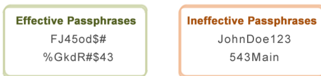
Fig.1 Sample Password

This will prevent others from accessing the router and you can easily maintain the security settings that you want. You can change the password from the Administration settings on your router’s settings page. The default values are generally admin / password.