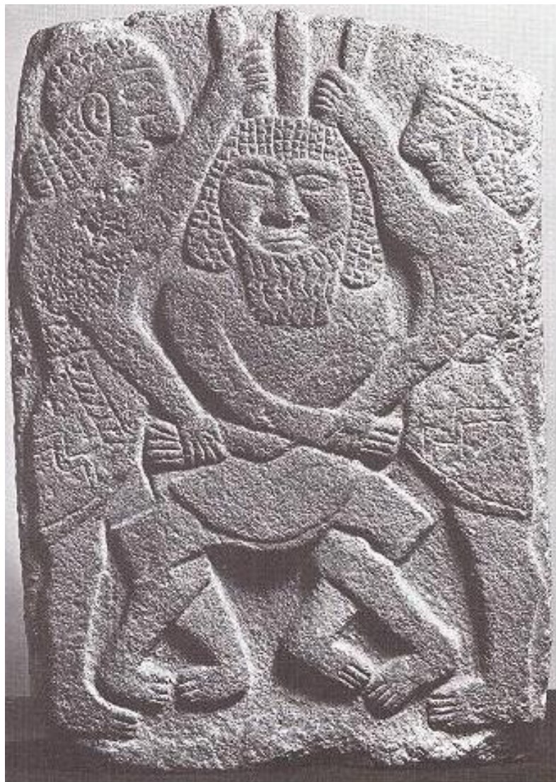
Gilgamesh and Enkidu's battle with Humbaba.

The eyes of Enkidu were full of tears and his heart was sick. He sighed bitterly and Gilgamesh met his eye and said, 'My friend, why do you sigh so bitterly? But Enkidu opened his mouth and said, 'I am weak, my arms have lost their strength, the cry of sorrow sticks in my throat, I am oppressed by idleness.' It was then that the lord Gilgamesh turned his thoughts to the Country of the Living; on the Land of Cedars the lord Gilgamesh reflected. He said to his servant Enkidu, 'I have not established my name stamped on bricks as my destiny decreed; therefore I will go to the country where the cedar is felled. I will set up my name in the place where the names of famous men are written, and where no man's name is written yet I will rise a monument to the gods. Because of the evil that is in the land, we will go to the