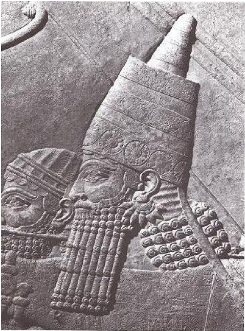
King Ashurbanipal, 669-627 B.C. The excavations of his library provided a major source of Mesopotamian literature, including a good portion of the Epic of Gilgamesh.

So the goddess conceived an image in her mind, and it was of the stuff of Anu of the firmament. She dipped her hands in water and pinched off clay, she let it fall in the wilderness, and noble Enkidu was created. There was virtue in him of the god of war, of Ninurta himself. His body was rough, he had long hair like a woman's; it waved like