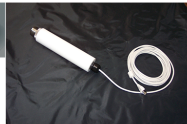
Figure 2: Lensed pyrometer options.