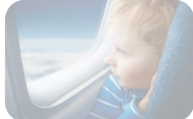
Aircraft & Aerospace