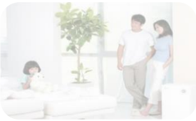
Indoor Air Quality