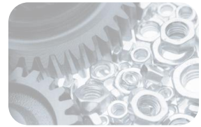
Industrial Process Manufacturing