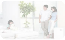
Indoor Air Quality