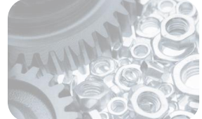
Industrial Process Manufacturing