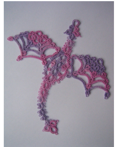
The Midday Dragon has a bright blue colour during most of the year but changes to spots of different shades of purple during midwinter. It can be confused with the Midnight Dragon during summer.