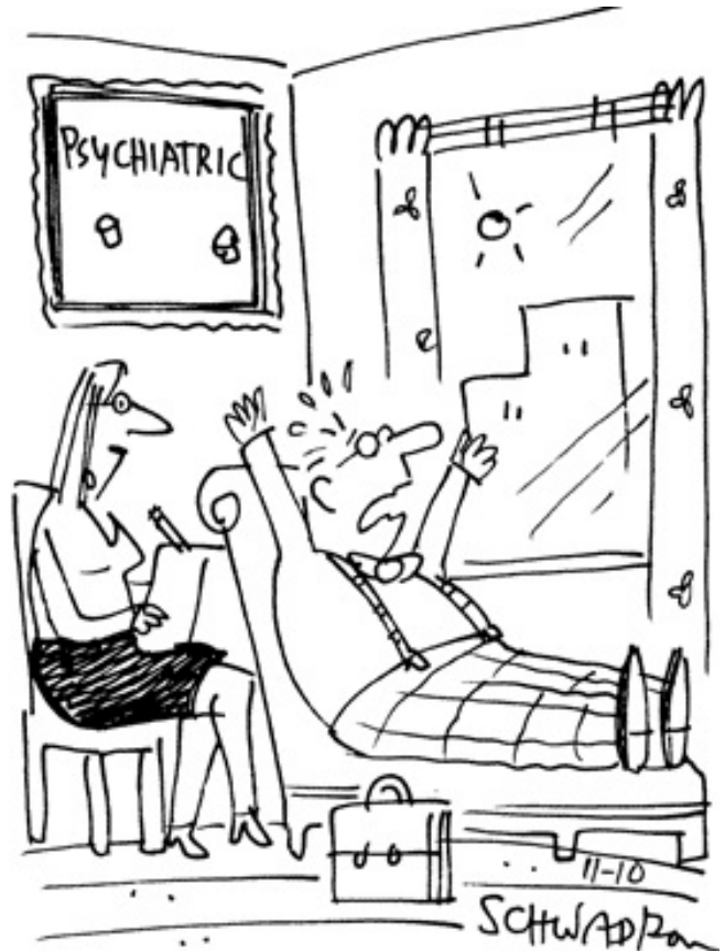
"Advertisers target everyone except me!"