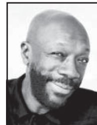
Isaac Hayes Artist/Songwriter

Learning-Sharing-Networking Over 40 Sessions/Events Tuition covers many meals/snacks!