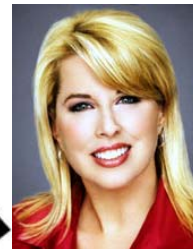
Rita Cosby Author/Commentator

JUNE 25-29, 2008 MARRIOTT CITY CENTER MINNEAPOLIS