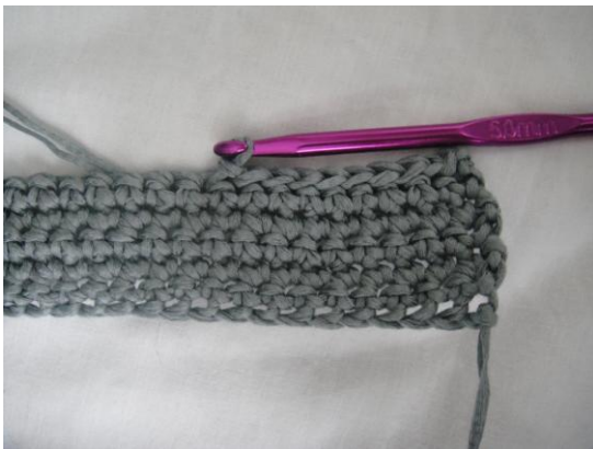
Slip stitch in each of the first 10 st's