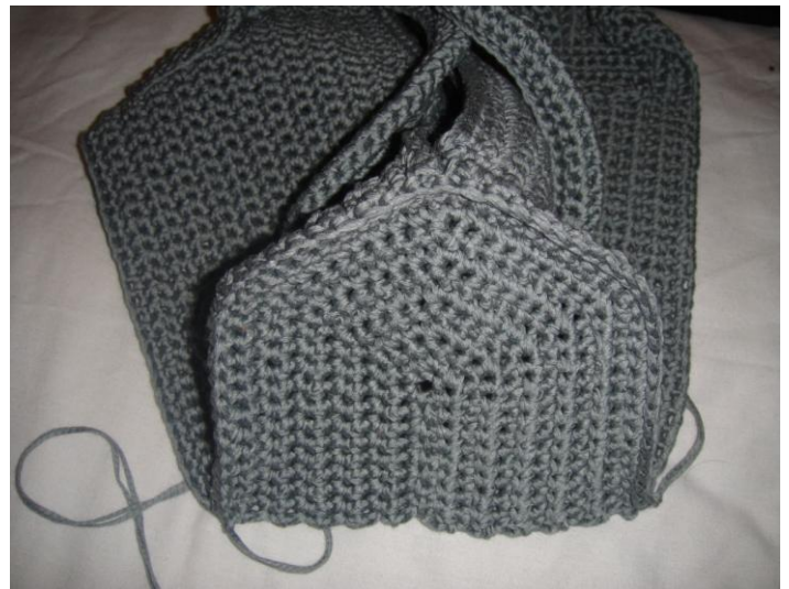
Side piece attached