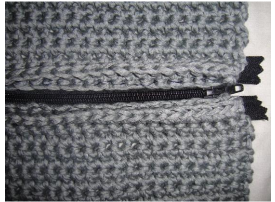
Sew zipper into inside row of sc's at top of side panel