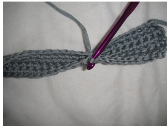
Sl st through both layers from the 11th st