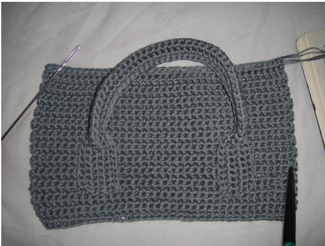
Sew the handles to the side panel using a running stitch