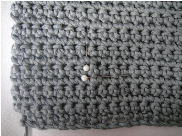
Mark 7 st's from side, 6 rows from the bottom

Repeat this for both sides of both handles.