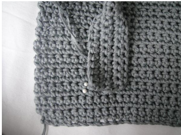
Line outside and bottom edges of handle up with pins