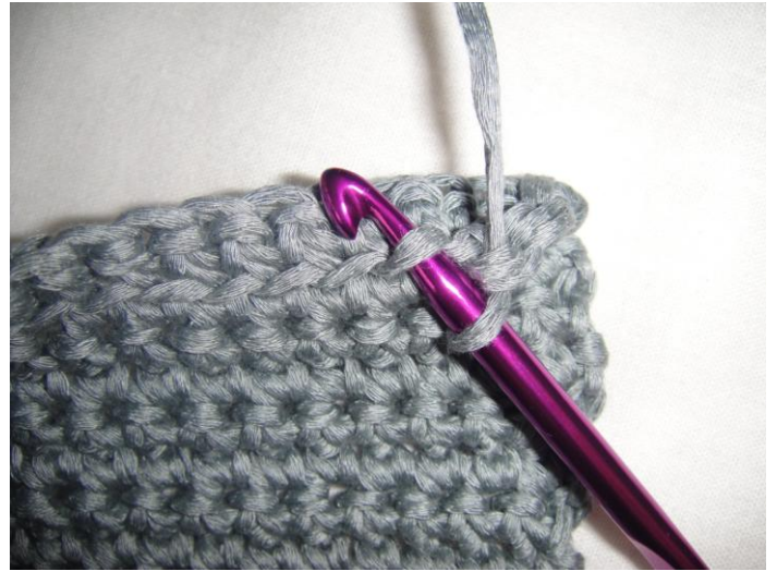
Work 1 sc into each remaining loop of round 25

7. Sl st in first 10 st's. Fold the handle in half width wise. Join by working a sl st through the 11 th st of both layers. Make 38 more sl st's through both layers. Ch 1 and bind off. You should now have 10 st's on either end that have not been joined.