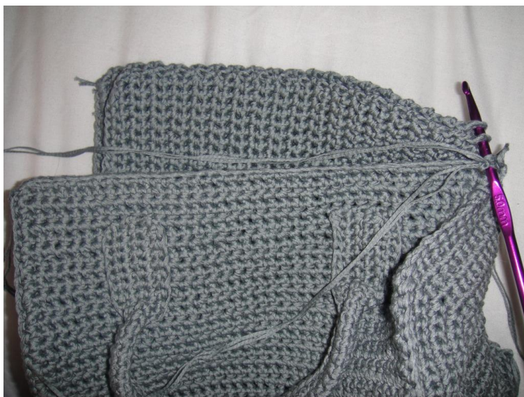
Work through all three layers to form an envelope in the base of your bag

The easiest option (of a bunch of hard ones, lol) is to line the foundation chains of the two bottom pieces up with each other and keep them to your right (shorter piece on top). Place your side panel on top. Sc through all three layers for all the rows until you get to the last st on the side. This one will only have 2 layers as the inside bottom panel is one row shorter than the outside one. So sc through the remaining layer of the bottom piece and the side panel for this one stitch. Work around the end piece through these 2 layers and in the first st on the opposite side panel. Then start working through all 3 layers again until you have gone all the way around.