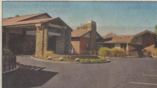
The entrance to SEM Haven, which was added in 1995, is on Cleveland Avenue in South Milford.