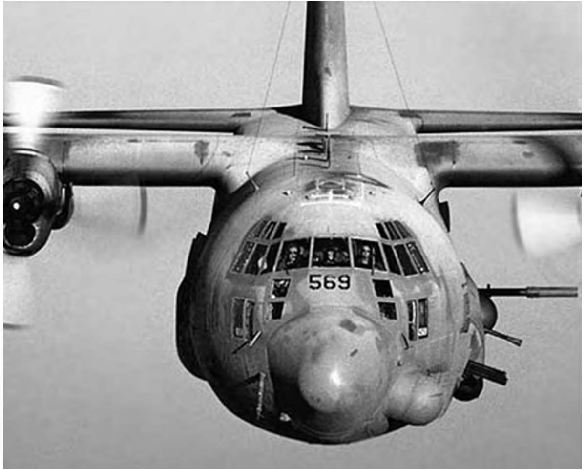
A head-on view of an AC-130 gunship, armament bristling on its side.

AS THE DAWN BEGAN TO BREAK THROUGH, THE AC-130Hs WERE ORDERED OUT OF THE AREA FOR FEAR OF BECOMING A TARGET FOR SHOULDER-FIRED SAMs