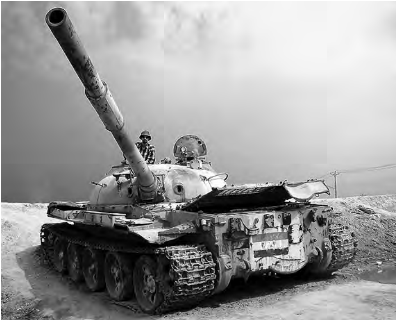
Captured Iraqi T-62.

KHALED'S CHOICE HAS BEEN CRITICIZED BY SOME ANALYSTS BECAUSE AL-KHAFJI WAS SURROUNDED BY [SALT MARSHES WHICH] FORCED THE IRAQI'S MAIN ASSAULT FORCES DOWN THE MAIN HIGHWAY...IN ORDER TO AVOID GETTING BOGGED DOWN IN THE MUDDY DESERT