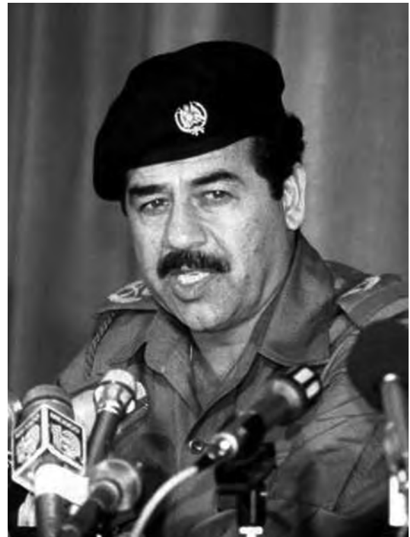
(Above right) Iraqi leader Saddam Hussein.

which had sortied, the Iraqi leader detailed his Soviet-built MiG fighter aircraft to Iran to prevent them from being destroyed by Coalition aircraft. Next, the Iraqi dictator unsuccessfully attempted to provoke the Israelis into the conflict in an effort to cause the Arab nations in the Coalition to withdraw. He hoped to make it a strategic war between the Arab world and the western world. The Iraqis fired Scud missiles at random Israeli targets. The Israelis, showing great restraint, refused to take the bait.