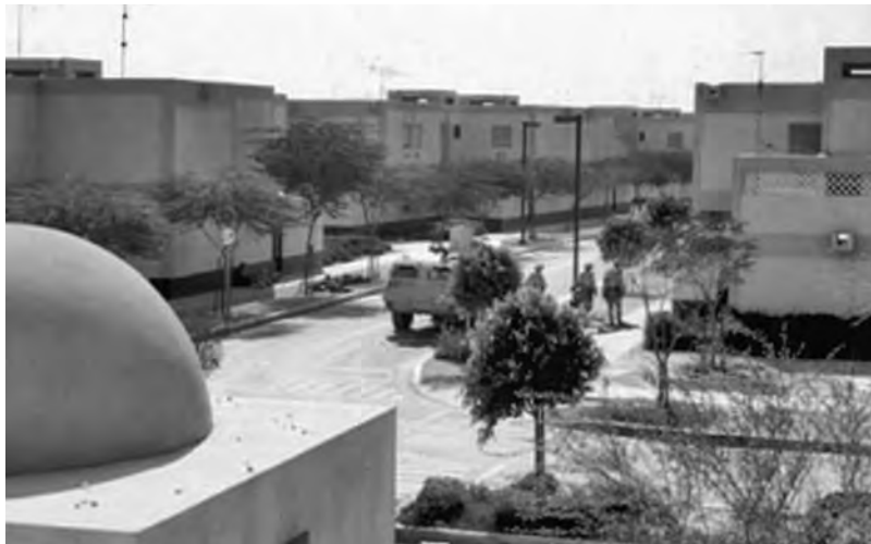
Saudi soldiers move through the evacuated border city of al-Khafji. (Photo courtesy of the U.S. Marine Corps History Division, study by Paul W. Westermeyer, photo by Capt Charles G. Grow.)

IRAQI ARTILLERY DESTROYED AN OIL STORAGE TANK NEAR AL-KHAFJI, SAUDI ARABIA, AND, ON JANUARY 19, THEY BREACHED THE PUMPS AT THE AHMADI LOADING COMPLEX DRAINING 200,000 BARRELS OF CRUDE OIL A DAY INTO THE GULF