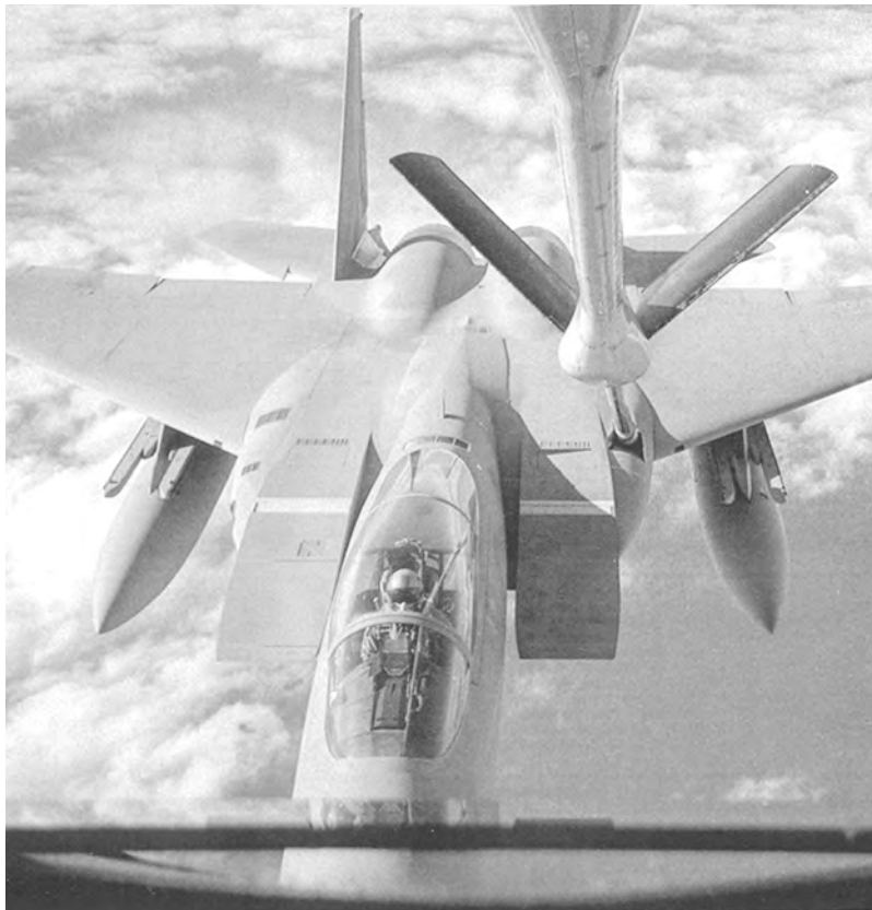
An F-15 refuels during Operation Deny Flight.

November 21, the presidents of Bosnia-Herzegovina, Croatia, and Serbia met at Wright-Patterson Air Force Base, Ohio, and produced an agreement to end the war in Bosnia and designate sectors for Serbs and non-Serbs. On December 14, international leaders signed a peace agreement in Paris to confirm the Wright-Patterson accords. 25