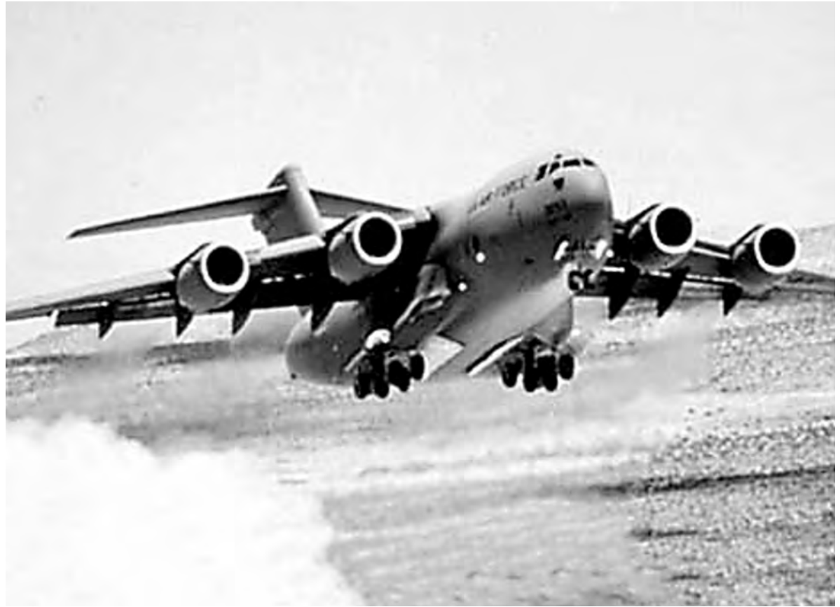
A C-17 takes off during Operation Provide Promise.