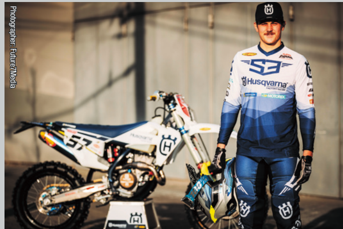
Billy Bolt, Husqvarna Factory Racing Enduro Team 2022

FIM Hard Enduro World Championship champion in 2021 equipped with 520MXU.