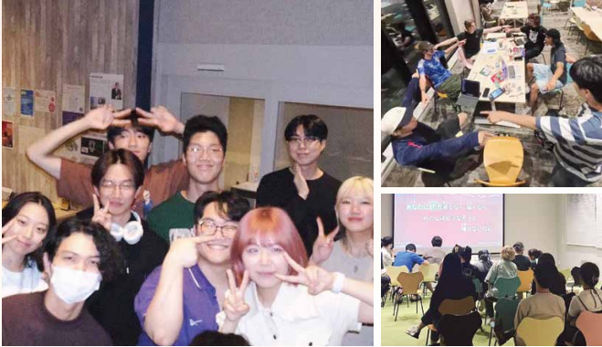
A scene from an event in the International Education Dormitory