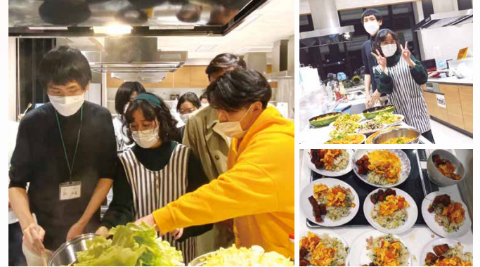
Chinese cooking class organized by a Chinese student