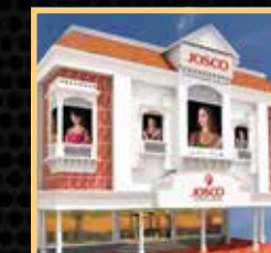
Cross Cut Road, Gandhipuram, Coimbatore