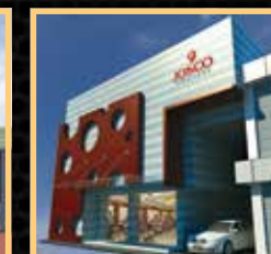
GB Road, Palakkad