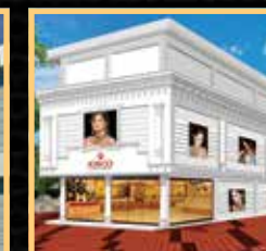
TB Road, Palakkad