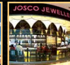
LULU Mall, Kochi