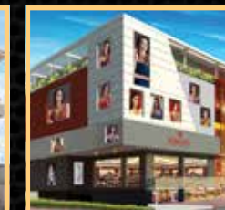
Near KSRTC, Elite Plaza, Thiruvalla