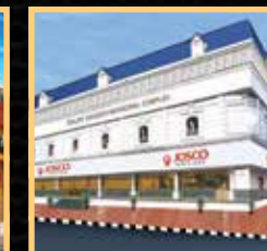
Rajiv Gandhi Complex, Kottayam