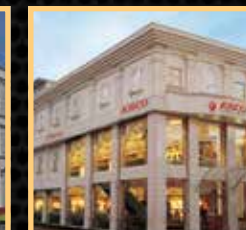
K.P. Road, Pathanamthitta