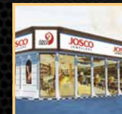
Near Market Jn, KK Road, Kottayam