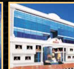
M.G. Road, North End, Kochi