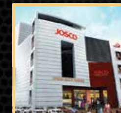
Josco Gold Tower, Palace Road, Thrissur