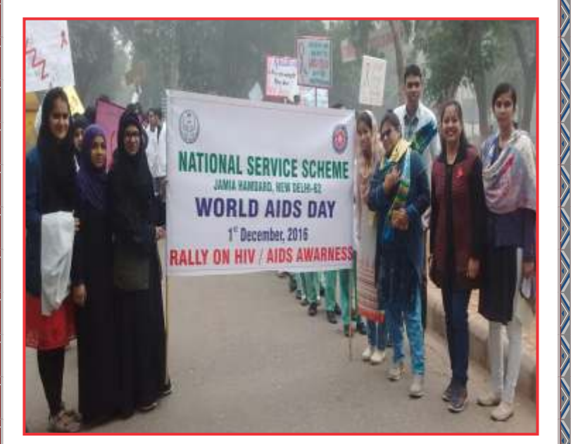
AIDS Awareness Rally

Email: urmila 48@rediffmail.com, bhardwaj@jamiahamdard.ac.in Call at: 26059688 (extn. 5680, 5682, 5683) Mobile No: +91-9891721631 (Bindu Shiju)