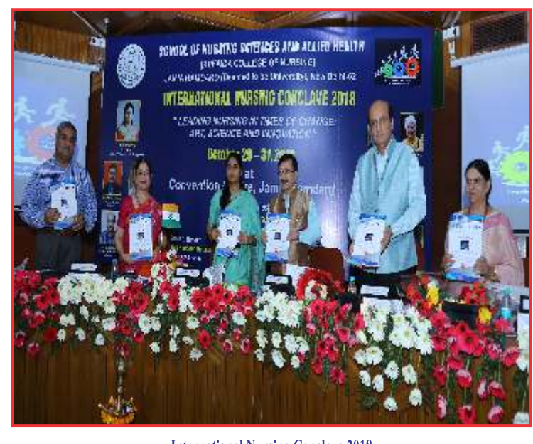
International Nursing Conclave 2018