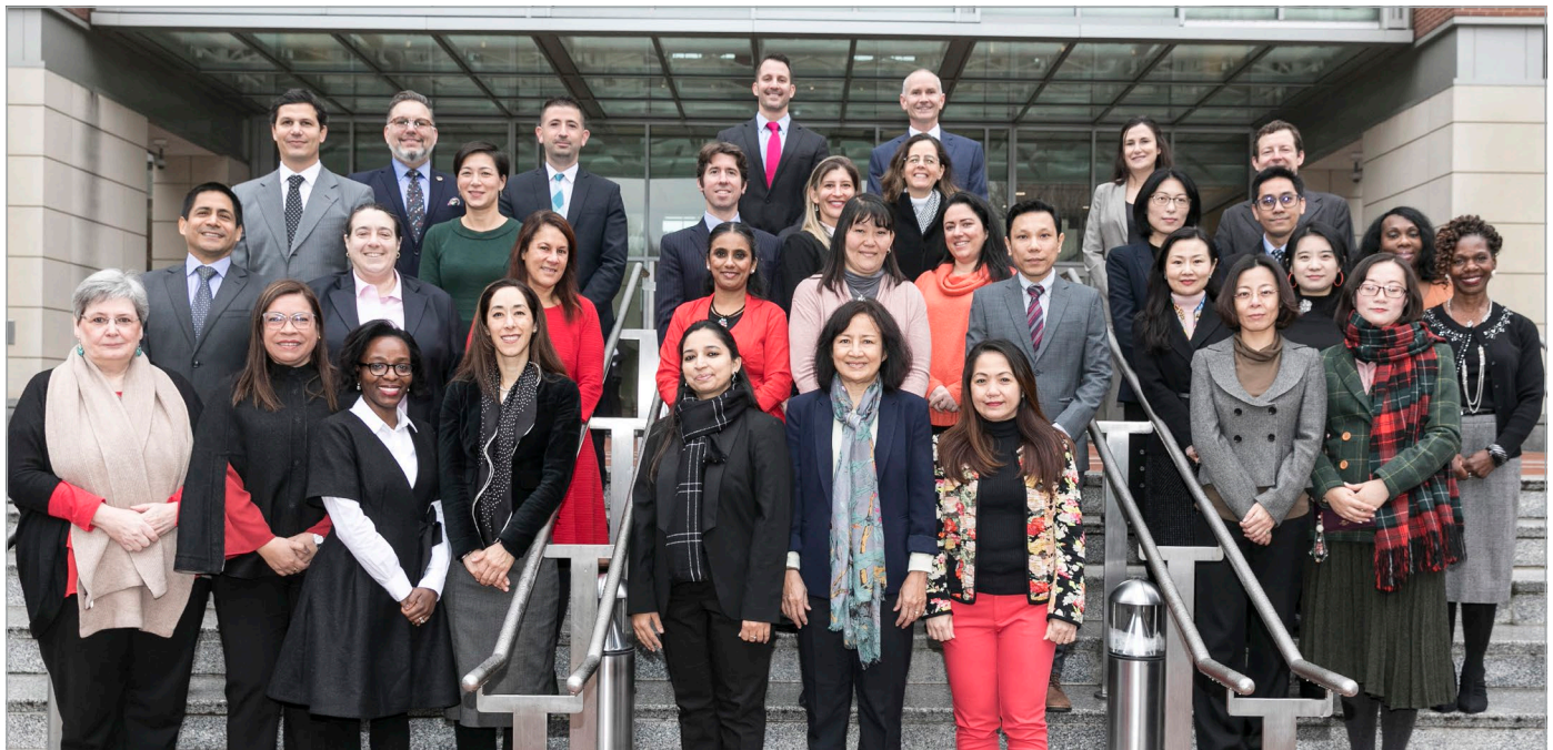
IP attachés and local staff with the headquarters-based IP Attaché Program team at the annual USPTO IP attaché consultations in Alexandria, Virginia.

He cherished his time serving in Mexico, where he engaged with diverse people and cultures. He then continued a successful career in the private sector as Corporate Counsel at Nintendo of America. He is currently Vice President of IP Protection and Security at the Entertainment Software Association.