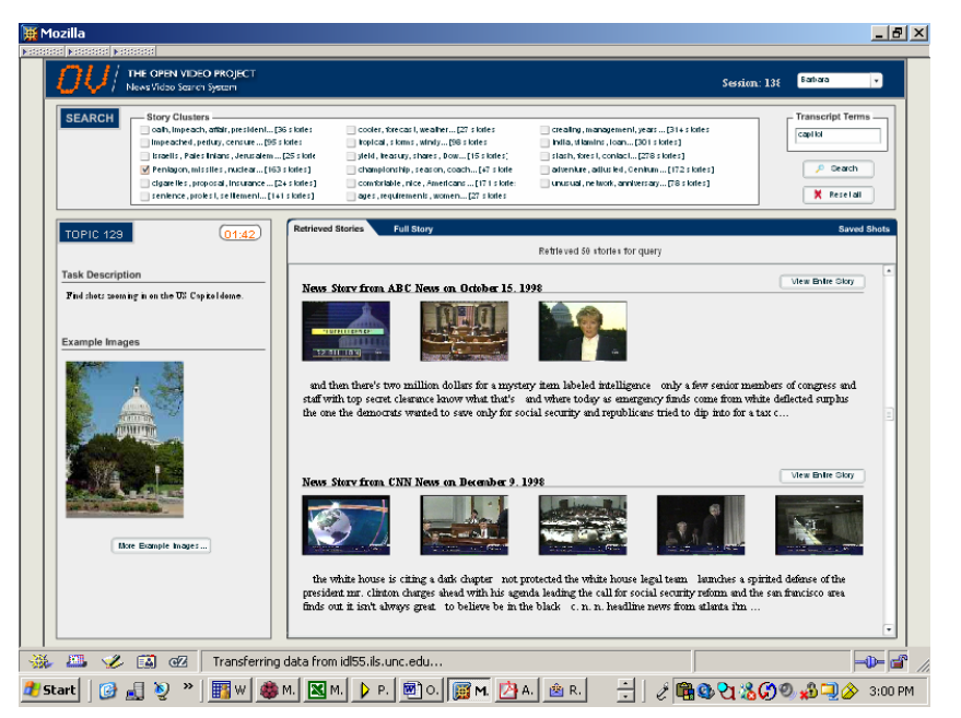
Figure 2. Cluster-based system, with display of initial results list

The average cluster score for each story, where the average was based on the story's cluster scores for just those clusters selected by the user when submitting the query, was then added to the MySQL relevance score in order to rank the retrieved shots.