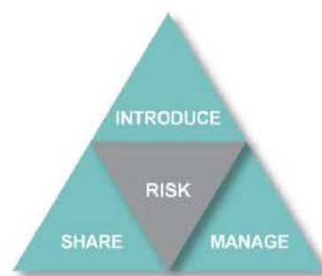
Figure 4.0 - Asset Grouping

A single third-party entity can represent all of these areas at the same time and impact the organization's overall risk posture. The first step to understanding the risks posed by third parties is to know the scope of the business relationship or service provided by the third party. To identify every applicable third party, an organization should study their CHD flows and any business processes involving CHD. In addition, an organization should consider third parties that are involved in the development, operation, or maintenance of their CDE (even those who do not directly handle cardholder information could still indirectly have an impact on the organization's CDE). Some examples of third parties and/or service providers to consider include: