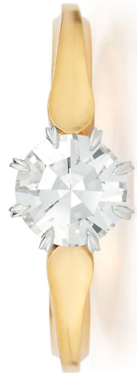
McII Petal 8 pr. (Top)