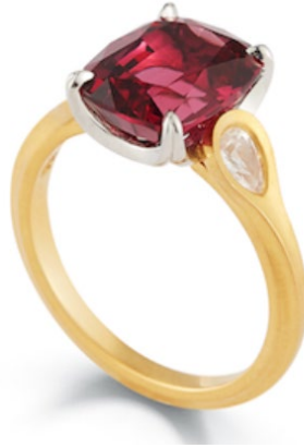
Leaf SR # 1-5726349401