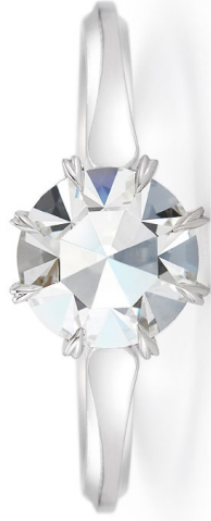
Mc2 Petal 8 Cut (Top)