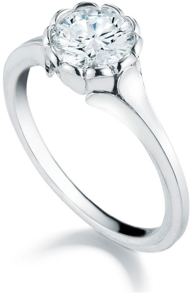
McII Bella Flora (Perspective)