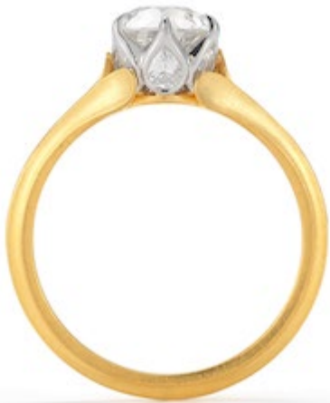
9592 Tulip Flora YG (Front)