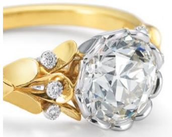
Wildflower “14 (Perspective)”