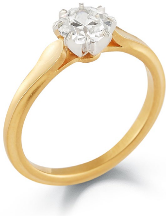
McII Petal Gold (Perspective)