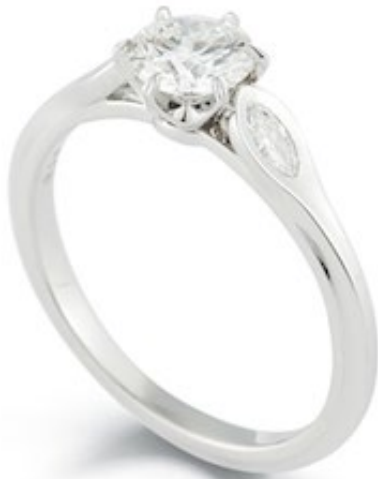
Marquise Petal perspective view

The Marquise Petal design is visually similar to the Petal design, with a shoulder in a similar shape, except Marquise Petal contains a small oval-shaped stone.