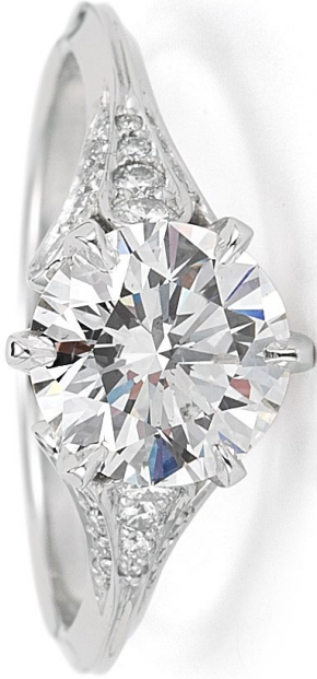
McII Flora Pave (Top)