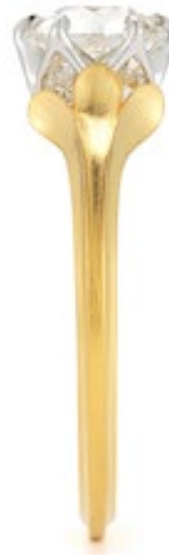
9592 Tulip Flora YG (Side)