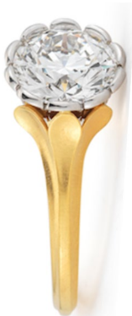
Bella Flora side view

Each of the deposits for Trillium depict a three-petal design for the shoulder, which is more elongated than the three-petal design in Bella Flora and Flora Pave . The petal design in Trillium goes higher up the ring head and uses longer petals than Bella Flora .