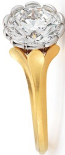
McII Bella Flora Gold (Perspective)