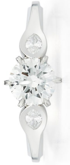
Marquise Petal SR # 1-5726349443