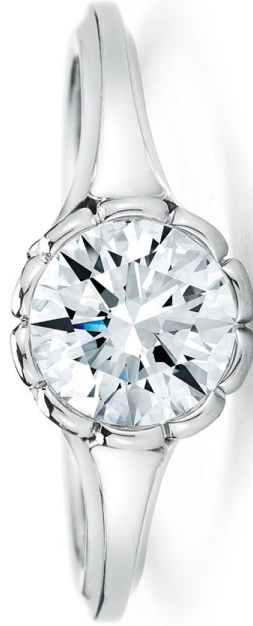
McII Bella Flora (Top)