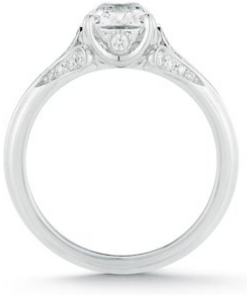
McII Flora Pave (Side)