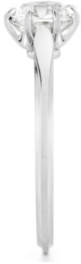
McII Petal (Side)