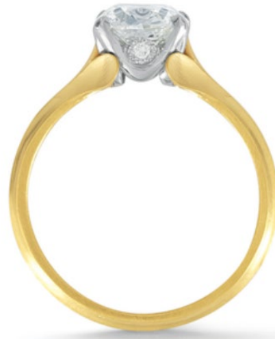
Trillium “8455 (Front)”