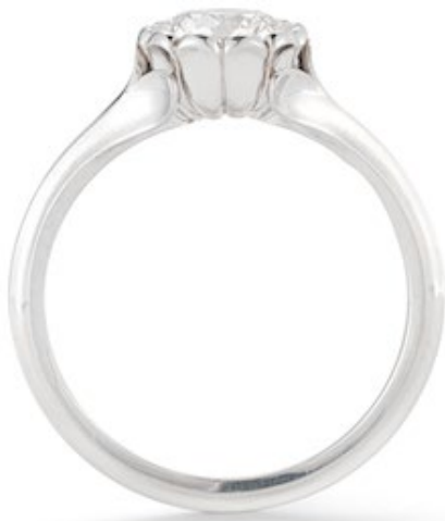
McII Bella Flora (Side)