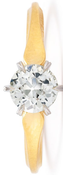
MCII Petal Tulip (Top)