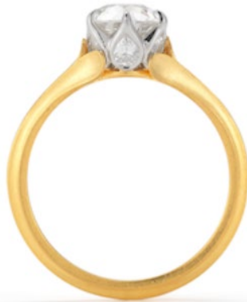
Trillium “9592 Tulip Flora YG (Front)”

If the Board viewed the claim for Trillium broadly, these deposit images would be inconsistent with the Office’s rule discussed previously that “a registration covers one individual work, and an applicant should prepare a separate application, filing fee, and deposit for each work that is submitted for registration.” COMPENDIUM (THIRD) § 511. 9 To the extent that there are multiple variations of Trillium with shared design elements, under the Copyright Act, the various designs have been “prepared in different versions,” and thus “each version constitutes a separate work.” 17 U.S.C. § 101 (definition of “created”).