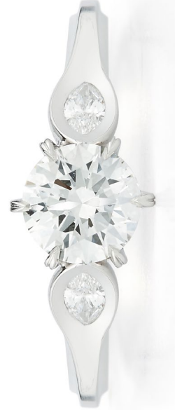
McII Marquise Petal (Top)