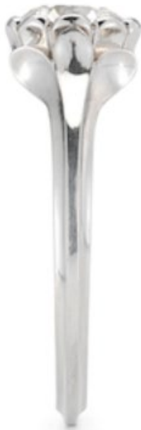
Trillium “9253 (Side)”