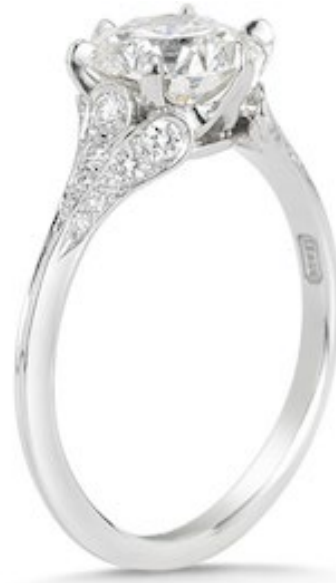
McII Flora Pave (Perspective 2)