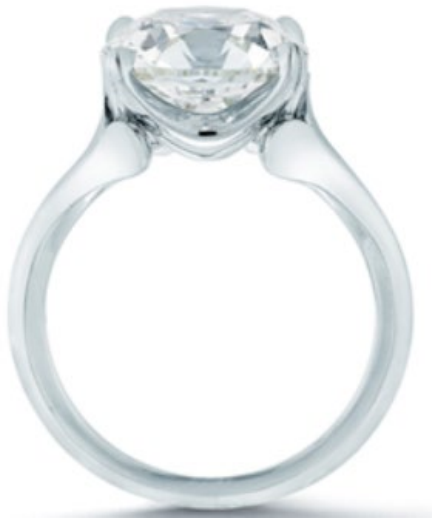
Trillium “8849 (Front)”