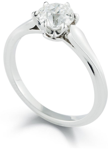
McII Petal (Perspective)