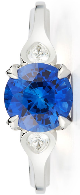
McII Leaf Sapphire (Top)