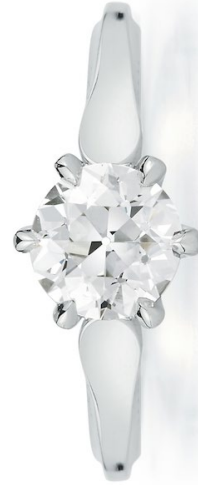
McII Petal 6 pr. (Top)