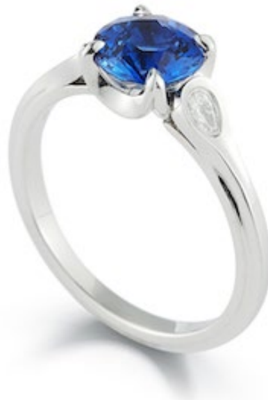
McII Leaf Sapphire (Perspective)