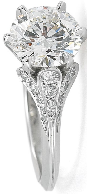
McII Flora Pave (Perspective)