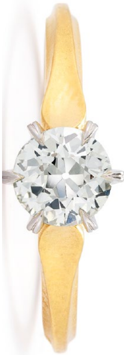
Petal SR # 1-5725399421