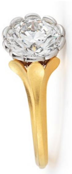
Bella Flora SR # 1-5726349267