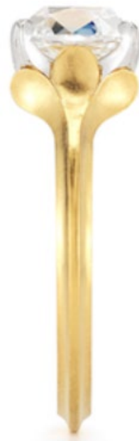
Trillium side view

But beyond this shared design element, however, the deposit images for Trillium depict multiple, inconsistent designs. One deposit depicts a small stone on the side of the ring head, whereas another shows the center stone presented without adornment. A third deposit image shows a ring with small teardrop-shapes surrounding the head, whereas a fourth shows the same scalloped bezel depicted in the Bella Flora design.