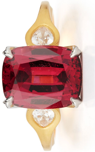
McII Leaf Gold/Red (Top)