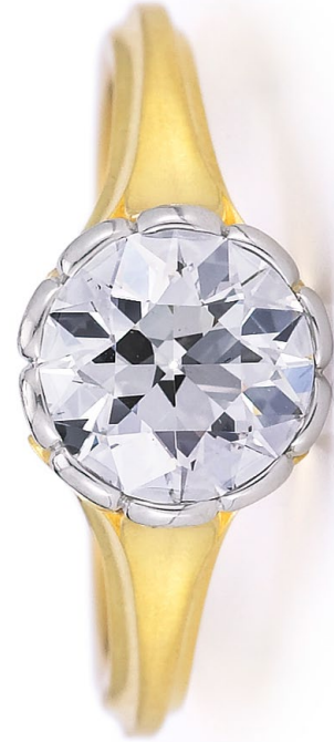
McII Bella Flora Gold (Top)