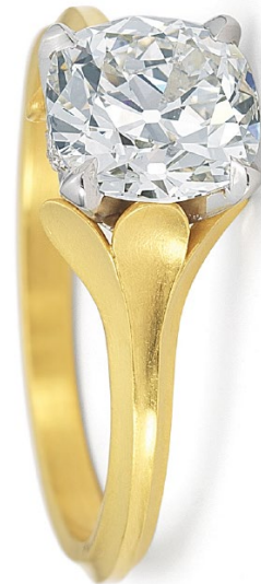
Trillium SR # 1-5726349577