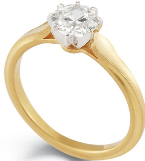
Petal perspective view

For the same reasons as Petal and Leaf , the Board concludes that the Marquise Petal design contains insufficient creative expression to meet the requirements for registration. Like Petal , the shape of the shoulder is a variation of a common geometric shape, which is not material that can support a copyright registration. 37 C.F.R. § 202.1(a). The addition of a small oval-shaped stone is a “commonplace design element[] arranged in a common or obvious manner” that does not materially change the design’s eligibility for protection. COMPENDIUM (THIRD) § 908.2. For these reasons, the Board concludes that the Marquise Petal design does not meet the statutory requirements for copyright protection and therefore cannot be registered.