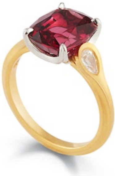
Mc2 Leaf Gold/Red (Perspective)