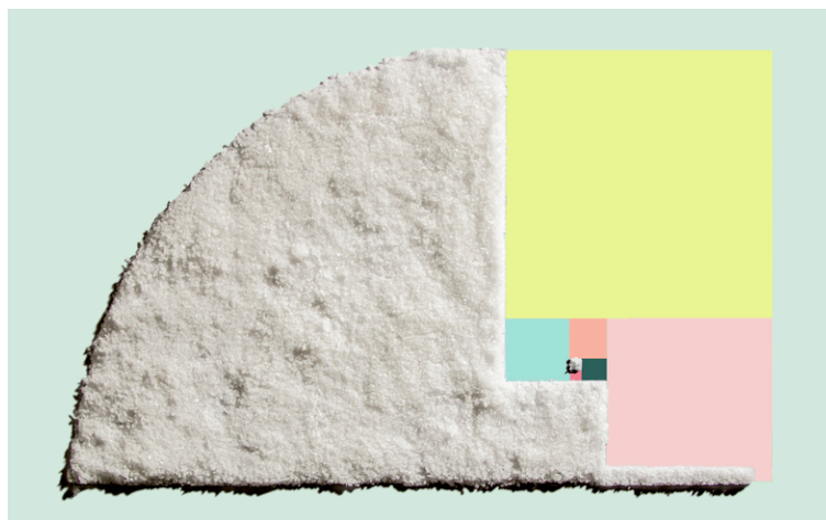
Figure 1. Rendition of part of the Fibonacci spiral. The bottom shows two overlapping horizontal lines, the one with a shadow has length c\pi/2 (like the the quarter circle of the spiral), the longer one ending in a pink segment has length c\phi .

Abstract. We give a proof of the inequality in the title in terms of Fibonacci numbers and Euler numbers via a combinatorial argument and asymptotics for these numbers. The result is motivated by Sidorenko's theorem on the number of linear extensions of a partially ordered set and its complement. We conclude with some open problems.