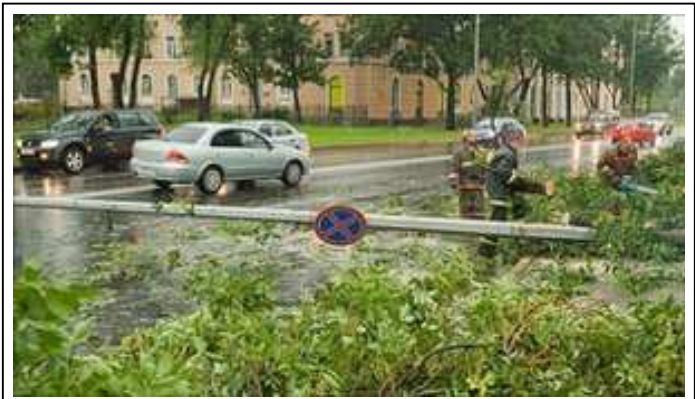
In line with Piers Corbyn’s detailed long range forecast storms battered St Petersburg Sunday 15 th Aug before moving towards Moscow as the jet stream changed as predicted. In Pakistan there were also extra deluges then marked abatement of rain as weather patterns changed as predicted.