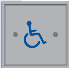
#59-WSS (Stainless Steel with Blue Paint Filled Legend)