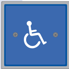
#59-W (Blue Powder Coat with White Paint Filled Legend)