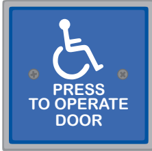
#59-H (Blue Powder Coat with White Paint Filled Legend)