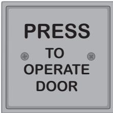
#59-P (Stainless Steel with Black Paint Filled Legend)