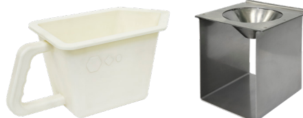
Plastic receiving container and box adapter for custom containers