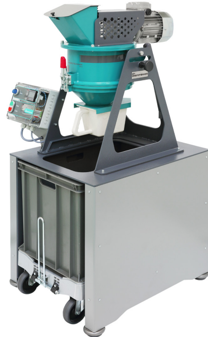
Soil grinder SG 1 on Stand with collecting bin and Control panel (recommended set)