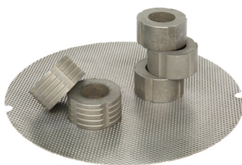
Discharge grate, smooth and toothed rollers