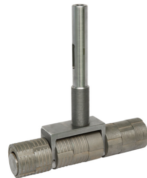
Drive shaft, fork and rollers on axis