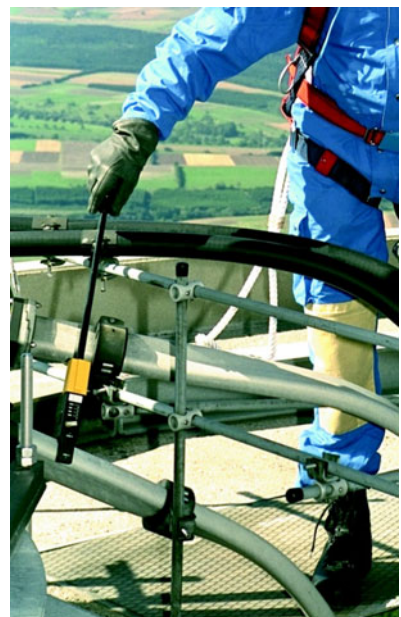
RadMan XT used as an instrument for leak detection