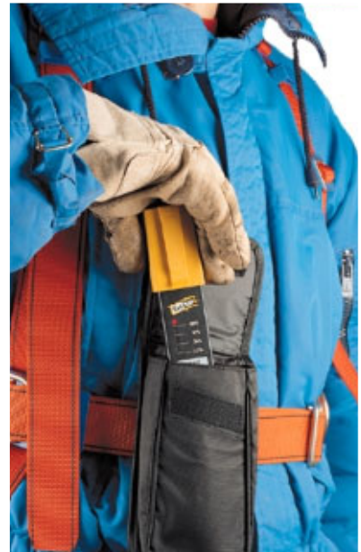
RadMan XT used as a personal monitor for radio frequency fields

As a locating unit all RadMan and RadMan XT versions can be used to locate leaks on waveguides and coaxial screw connectors (picture on the right). A non-conductive extension with handle is available as an optional accessory.