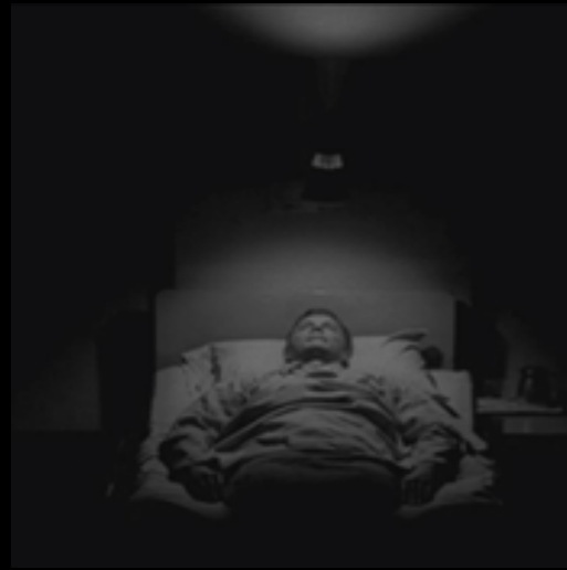
Effective photography used to spiral in from the spaceship to the hospital ward.

Parallel worlds, or planes of existence, was a theme that Twilight Zone explored many times, mostly in Serling's episodes. Here Serling started with the basic idea of "Mirror Image" of Season 1. The space travel element was added and in so doing, Serling came up with an even more intriguing story. But the director did not stress fast-paced dramatic progression and the result is 52 minutes that, in the end, come off as rather ho-hum. There are several fine sequences, notably the discovery of the spacecraft that Gaines went up in not being the same as the one he arrived back in. The pale ending, where a radio communication from another Col. Robert Gaines comes in to NASA after Gaines - already having returned from the mission - is seen running toward the spacecraft is indeed spooky but concludes things on a bland note when nothing ever comes of this. This seems to be a patched-up finish. Thankfully, a final shot of Gaines going home - in 'the real world' - was included. Viewers with sharp eyes will notice that the front of the Gaines homefront - with and without the picket fence - was used not once, but in three episodes that season. In those days, there was not much thought given to re-runs and video releases of TV shows!