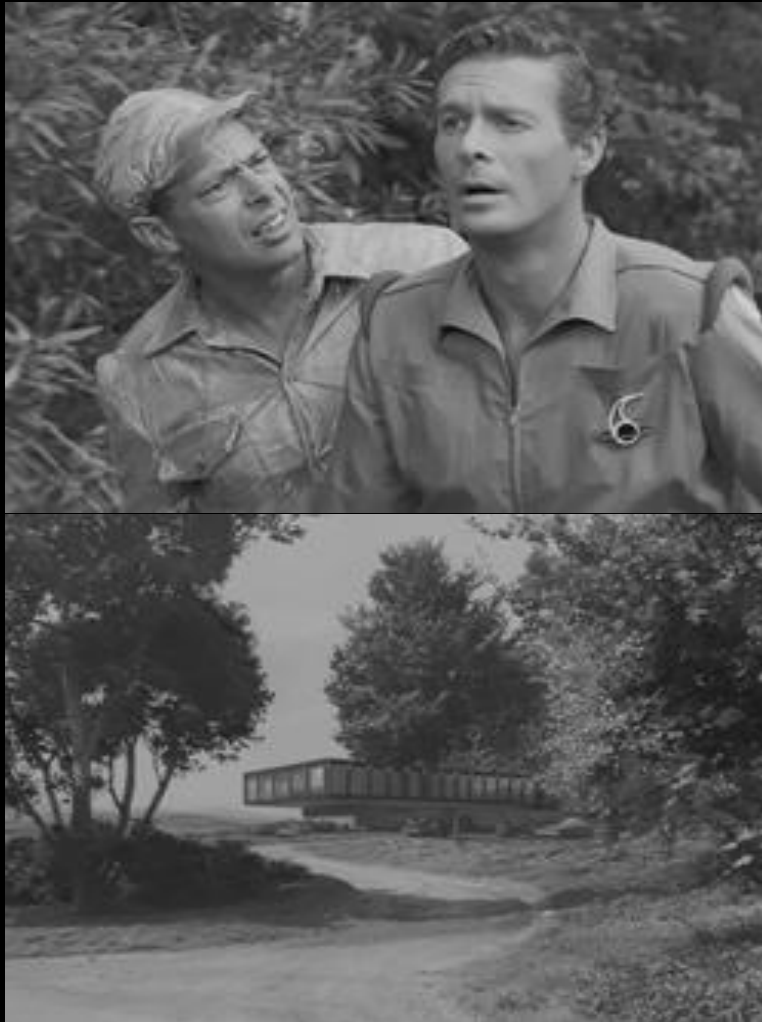
Lt. Mike Carter is more interested in getting home to his wife than in hunting. The Carter home. Nearly sixty years later, it still passes as a futuristic-looking residence.