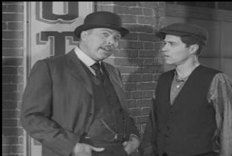
Feathersmith and Hecate. Albert Salmi and Wright King.