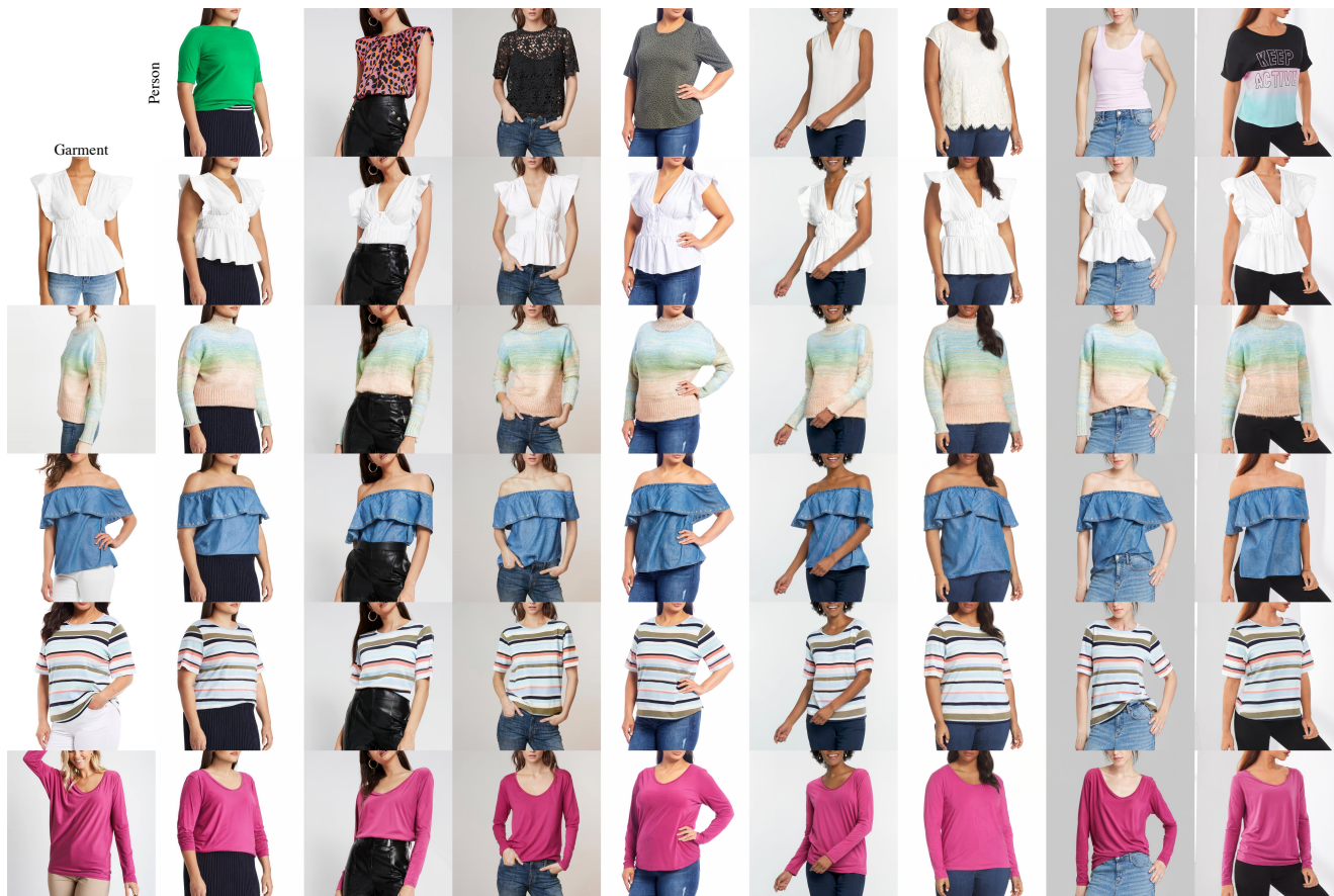
Figure 7. TryOnDiffusion on eight target people (columns) dressed by five garments (rows). Zoom in to see details.

Limitations. First, our method exhibits garment leaking artifacts in case of errors in segmentation maps and pose estimations during preprocessing. Fortunately, those [9,26] became quite accurate in recent years and this does not happen often. Second, representing identity via clothing-agnostic RGB is not ideal, since sometimes it may preserve only part of the identity, e.g. , tattoos won't be visible in this representation, or specific muscle structure. Third, our train and test datasets have mostly clean uniform background so it is unknown how the method performs with more complex backgrounds. Finally, this work focused on upper body clothing and we have not experimented with full body try-on, which is left for future work. Fig. 6 demonstrates failure cases.