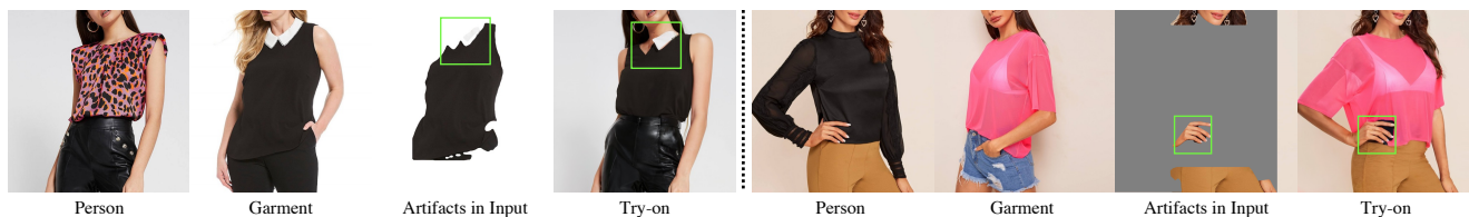
Figure 6. Failures happen due to erroneous garment segmentation (left) or garment leaks into the Clothing-agnostic RGB image (right).