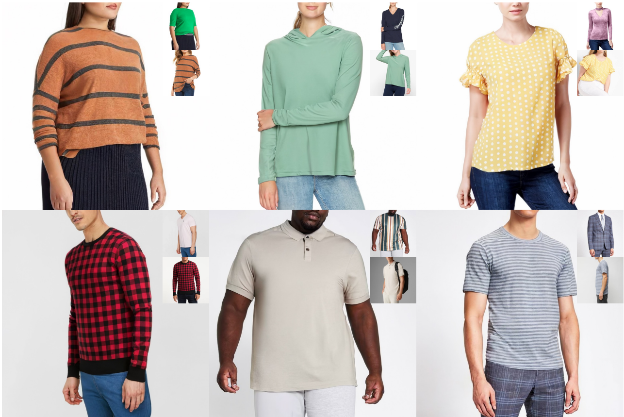
Figure 1. TryOnDiffusion generates apparel try-on results with a significant body shape and pose modification, while preserving garment details at 1024 \times 1024 resolution. Input images (target person and garment worn by another person) are shown in the corner of the results.