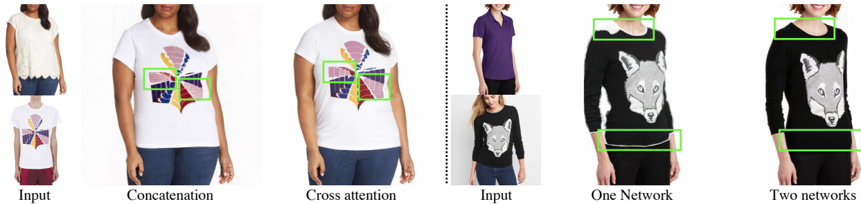
Figure 5. Qualitative results for ablation studies. Left: cross attention versus concatenation for implicit warping. Right: One network versus two networks for warping and blending. Zoom in to see differences highlighted by green boxes.

ically, we observe that TryOnGAN struggles to retain the texture pattern of the garments while SDAFN and HR-VITON introduce warping artifacts in the try-on results. In contrast, our approach preserves fine details of the source garment and seamlessly blends the garment with the person even if the poses are hard or materials are complex (Fig. 3, row 4). Note also how TryOnDiffusion generates realistic garment wrinkles corresponding to the new body poses (Fig. 3, row 1). We show easier poses in the supplementary (in addition to more results) to provide a fair comparison to other methods.