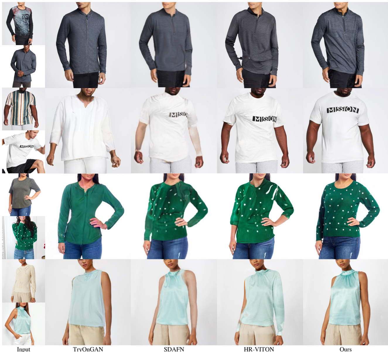
Figure 3. Comparison with TryOnGAN [24], SDAFN [2] and HR-VITON [23]. First column shows the input (person, garment) pairs. TryOnDiffusion warps well garment details including text and geometric patterns even under extreme body pose and shape changes.

compute Frechet Inception Distance (FID) [14] and Kernel Inception Distance (KID) [3] as evaluation metrics. We computed those metrics on both test datasets (our 6K, and VITON-HD) and observe a significantly better performance with our method.