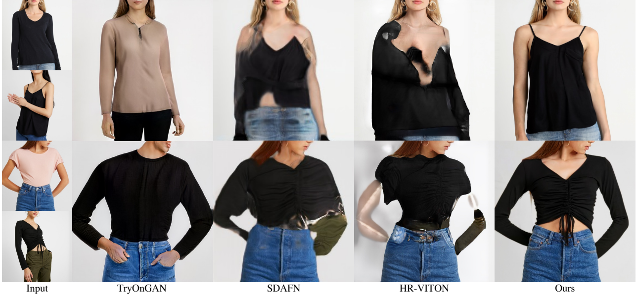
Figure 4. Comparison with state-of-the-art methods on VITON-HD dataset [5]. All methods were trained on the same 4M dataset and tested on VITON-HD.